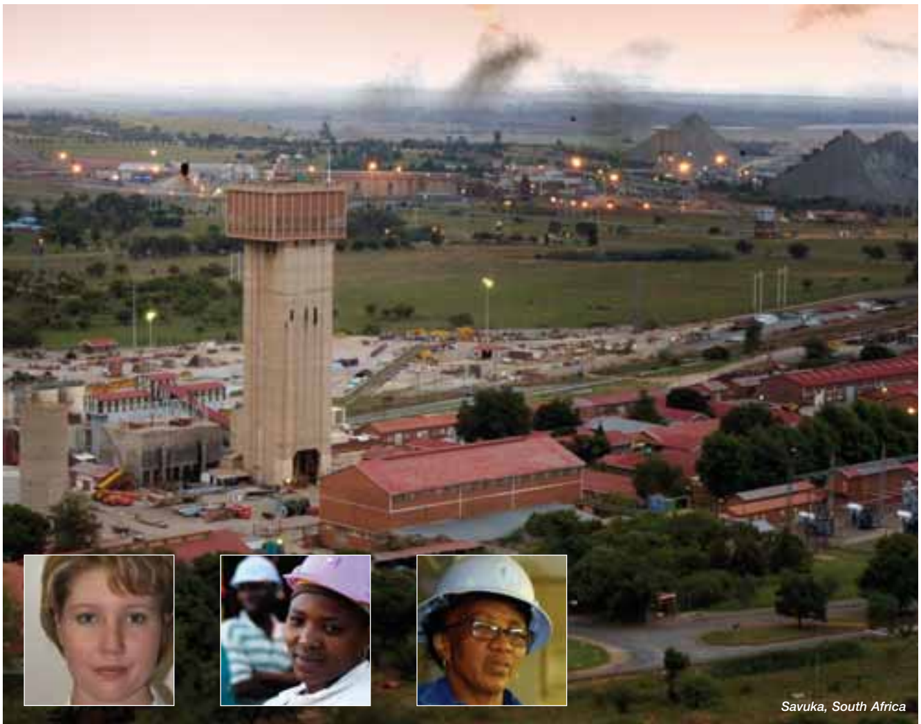
Savuka, South Africa