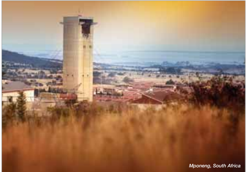
Mponeng, South Africa